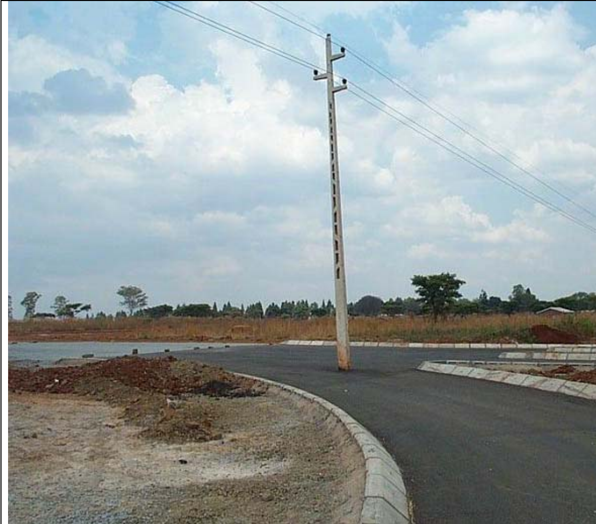
In Eritrea, goats receive special treatment